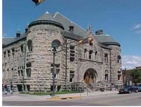
Mabel Tainter Memorial Theater