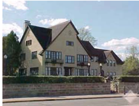
Wilson Palace Mansion